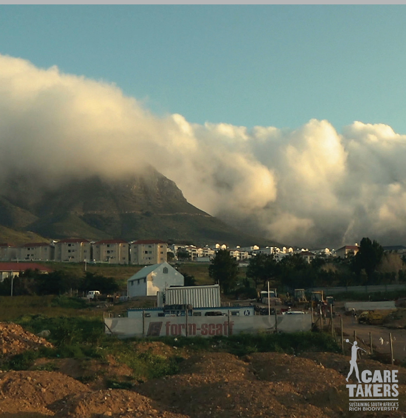
Table Mountain & The People of District Six